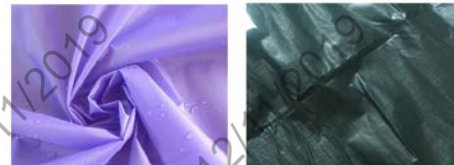
Umbrella cloth, oxford cloth and PU all tried. The vinyl won for the outer cover.

We knew the first place to start was to address the safety and convenience issues that come with the cloth case of traditional pillows. Among several ideas, we chose to create a two-piece design. This component alone would allow easy removal for laundering and sanitizing. In addition, it would broaden use from one patient to a communal product.